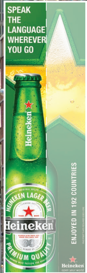
View from 23rd St.

TO MAXIMIZE THE NOMAD'S LONG READ ALONG 6TH AVENUE, BRANDED CITIES SUGGESTS KEEPING IMPORTANT IMAGERY AND TEXT TO THE LEFT HALF OF THE CREATIVE.